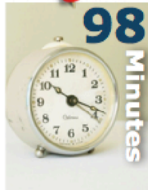
Average time spent per month on site