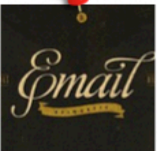
Employs Aggressive Reengagement emails to notify users