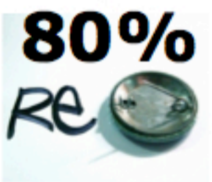
"Re-pinned" Items on Pinterest