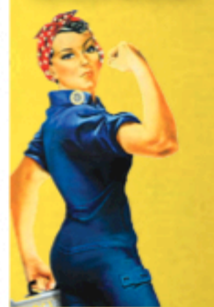
Pinterest's Facebook Fans