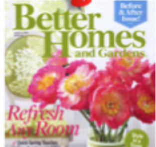
Better Homes and Gardens