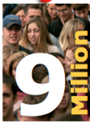
Monthly Facebook Connected Users