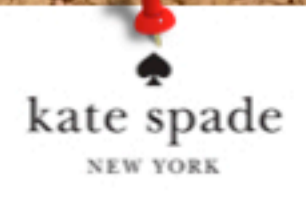
Kate Spade New York